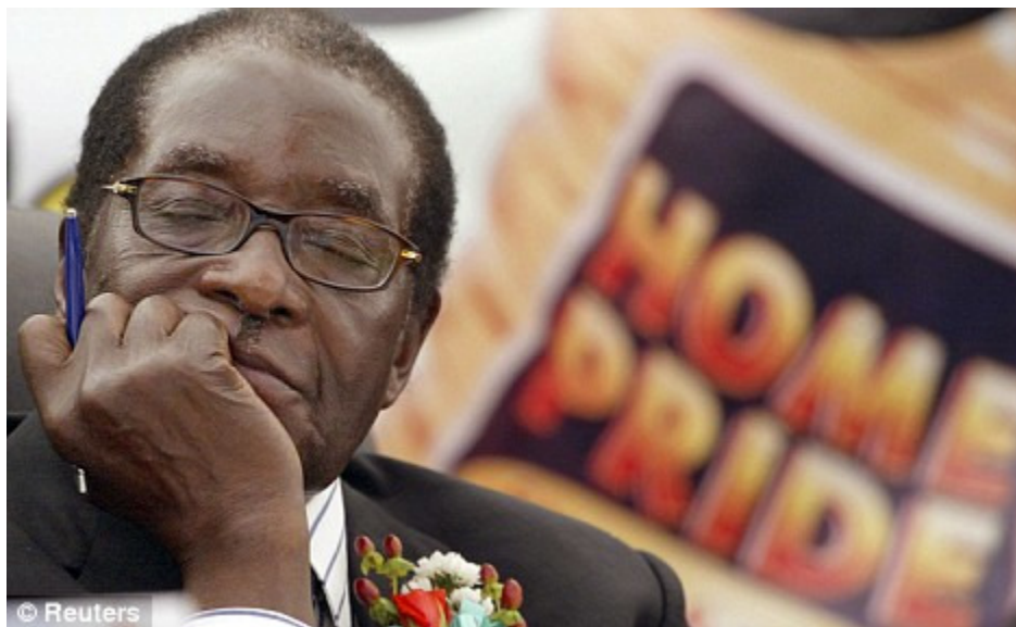
Mugabe has received hundreds of millions of pounds from Chinese sources

In effect, through its supplies of arms and support, China has been accused of underwriting a humanitarian scandal. The atrocities in Sudan have been described by the U.S. as 'the worst human rights crisis in the world today'.