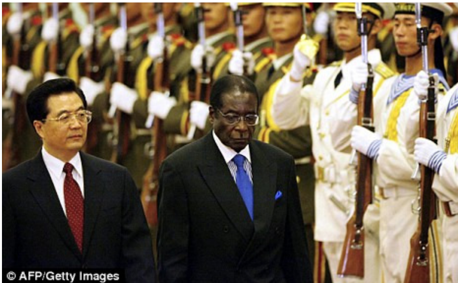
Close relations: Chinese President Hu Jintao accompanies Zimbabwe President Robert Mugabe to a ceremony in the Great Hall of the People in Beijing

'I should expect that the African seaboard, now sparsely occupied by lazy, palavering savages, might in a few years be tenanted by industrious, order-loving Chinese, living either as a semidetached dependency of China, or else in perfect freedom under their own law.'