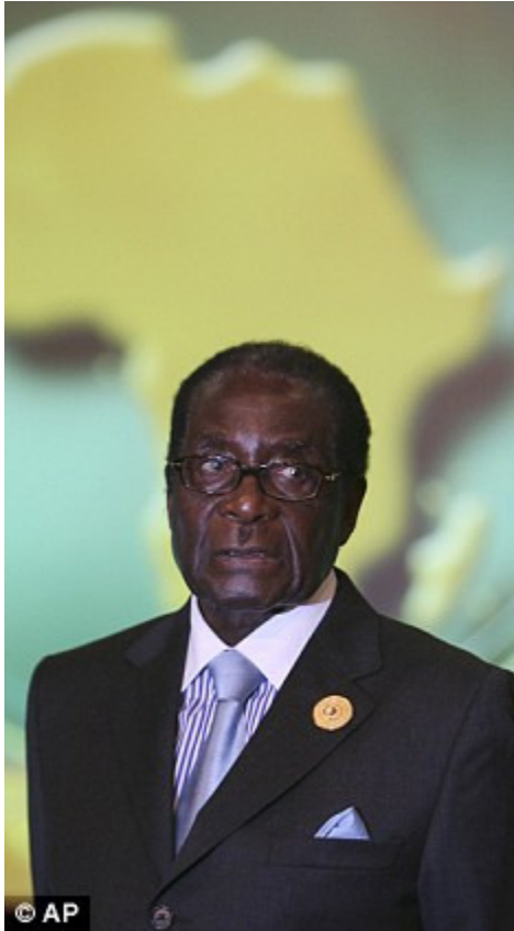
President Robert Mugabe leaving the eleventh ordinary session of the assembly of the African Union heads of State and government in Sharm el-Sheikh, Egypt

China is hungry - for land, food and energy. While accounting for a fifth of the world's population, its oil consumption has risen 35-fold in the past decade and Africa is now providing a third of it; imports of steel, copper and aluminium have also shot up, with Beijing devouring 80 per cent of world supplies.